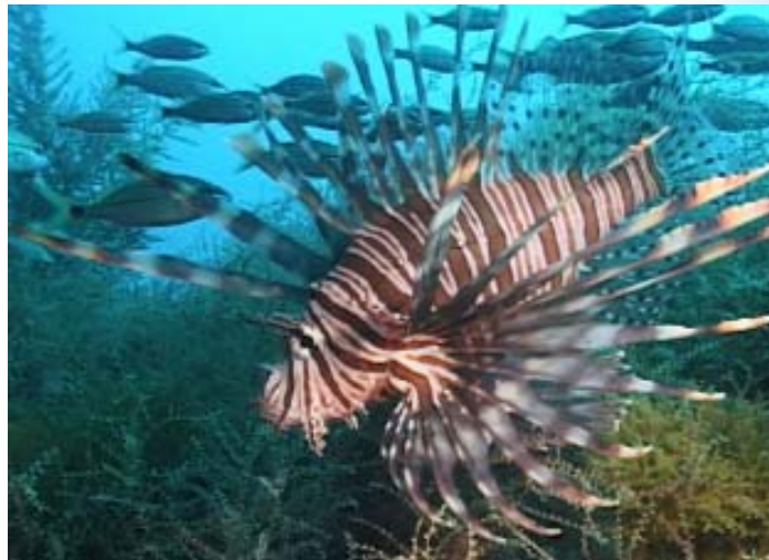
Beautiful and venomous, Indo-Pacific lionfish are a recent East Coast U.S. introduction.

Invasive species affect each of our lives, all regions of the United States, and every nation in the world. Society pays a great price for invasive species – costs measured in billions of dollars, damaged goods and equipment, environmental degradation, increased disease epidemics, and lost lives. Alien species invasions can result in native species and biological diversity loss at a rate second only to habitat destruction. Some of the most serious and costly invader species include human, animal, and plant diseases (e.g., West Nile virus, trout and salmon whirling disease, sudden oak death), agricultural pests (e.g., Japanese beetle, Russian thistle), and a host of seemingly innocuous species whose sheer numbers overwhelm ecosystems (e.g., zebra mussels and hydrilla).